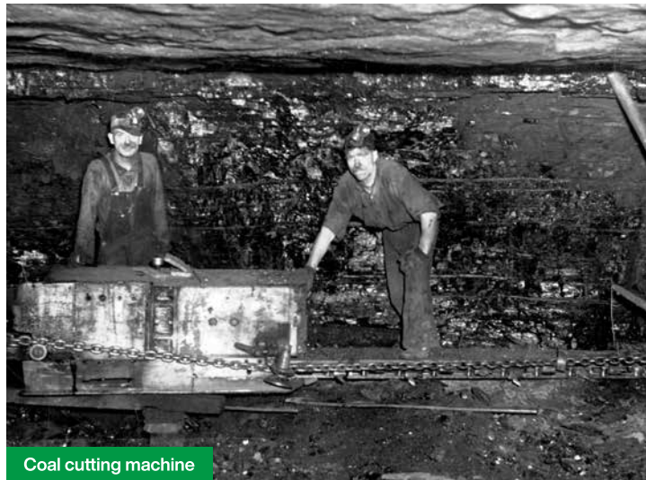
Coal cutting machine