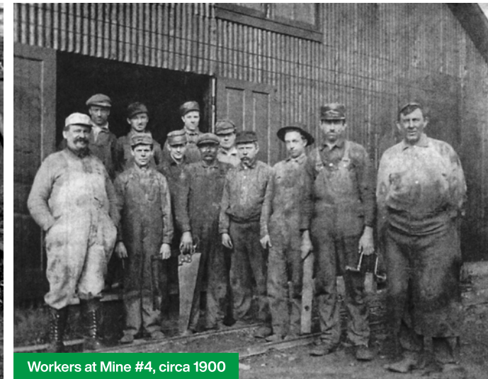
Workers at Mine #4, circa 1900