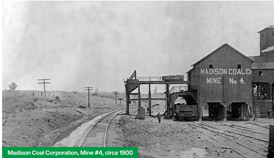
Madison Coal Corporation, Mine #4, circa 1900

Due to the 8-month strike, the Madison Coal Corporation took 52 mules out of Mine #2 and Mine #4. Since the mules had not been out of the mines for several years, citizens were amused to see the antics of the animals as they kicked up their heels in the enjoyment of the warm sunlight.