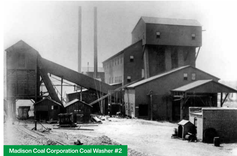
Madison Coal Corporation Coal Washer #2