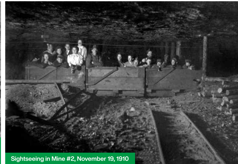
Sightseeing in Mine #2, November 19, 1910